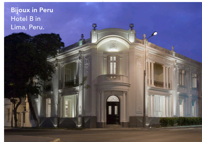
Bijoux in Peru Hotel B in Lima, Peru.

Not content with gargling on stunning wines made from these two varieties in France’s Loire Valley, we’re also developing a thirst for local examples such as Jauma’s apple-tarty chenin blanc from McLaren Vale and Jamsheed’s berry-sappy cabernet franc from the Yarra Valley. jauma.com ; jamsheed.com.au